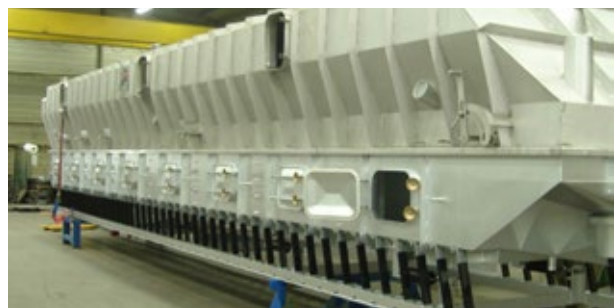
Vibrating Fluid Bed Drier